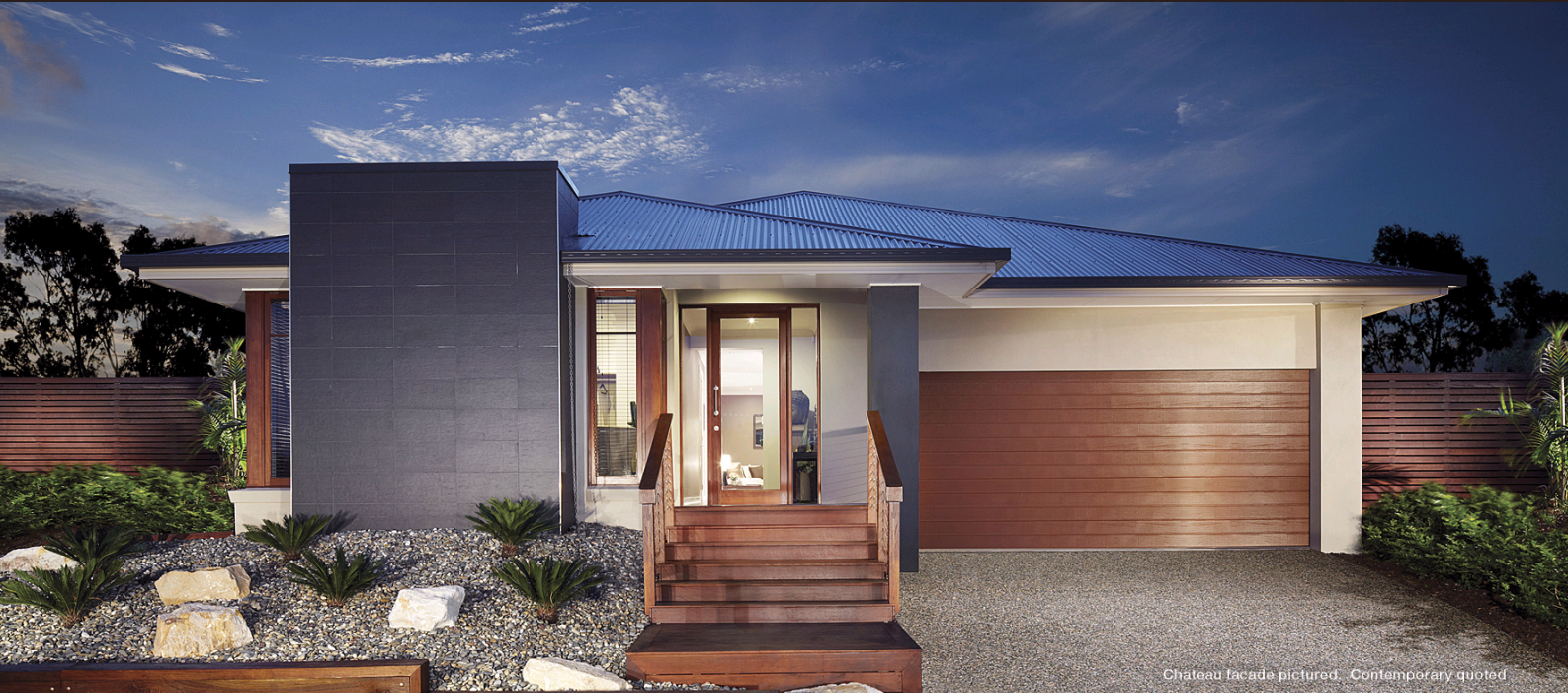
Chateau facade pictured. Contemporary quoted