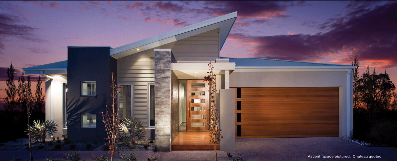
Ascent facade pictured. Chateau quoted